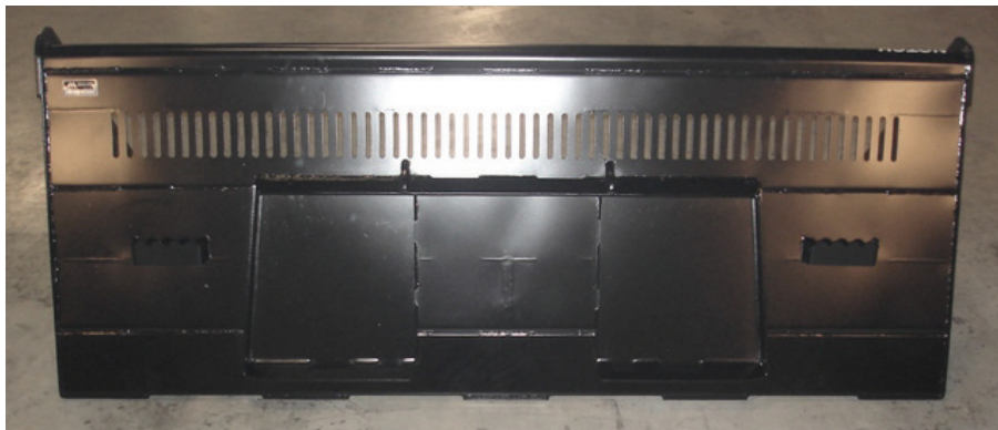
Universal attachments standard, other attachments available