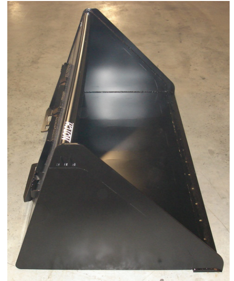
Box 30" High x 42" Deep

Recommended for loaders with operating capacity of 3000 lbs. or less